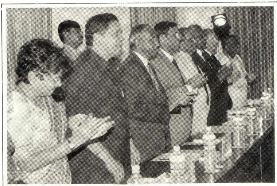
Hon'ble Judges of the Supreme Court at the Judicial Colloquium on Science, Law and Ethics