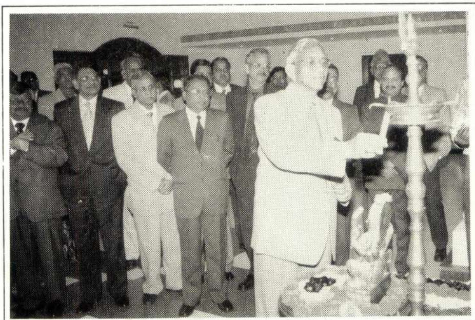
Hon'ble Mr. Justice R.C. Lahoti, Chief Justice of India, inaugurating the Auditorium on 18 th February, 2005