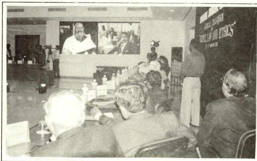
His Excellency, the President of India, Dr. A.P.J. Abdul Kalam, delivering the Keynote Address through a video-conference at the Judicial Colloquium on Science, Law and Ethics for High Court Judges on 19 th February, 2005