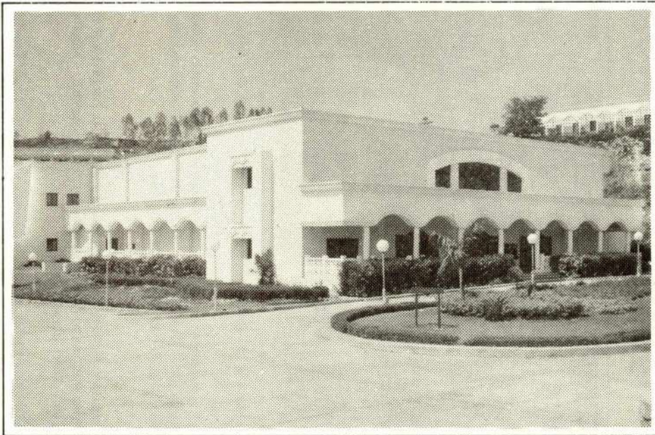
The National Judicial Academy Auditorium